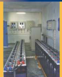
10 kWp Centralized System - Herd - Morocco