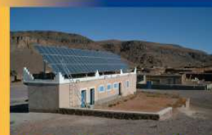
10 kWp Centralized System - Ekbourtir - Morocco